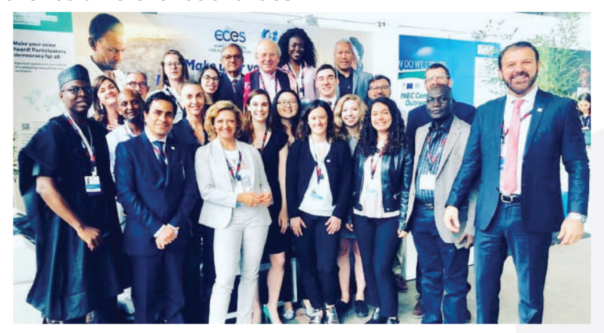
ECES Team during European Development Days 2019

ECES employs a diverse team of highly skilled international, regional and national electoral experts collaborating on its projects, having thus far contracted more than 2000 individuals, representing over 60 different nationalities .