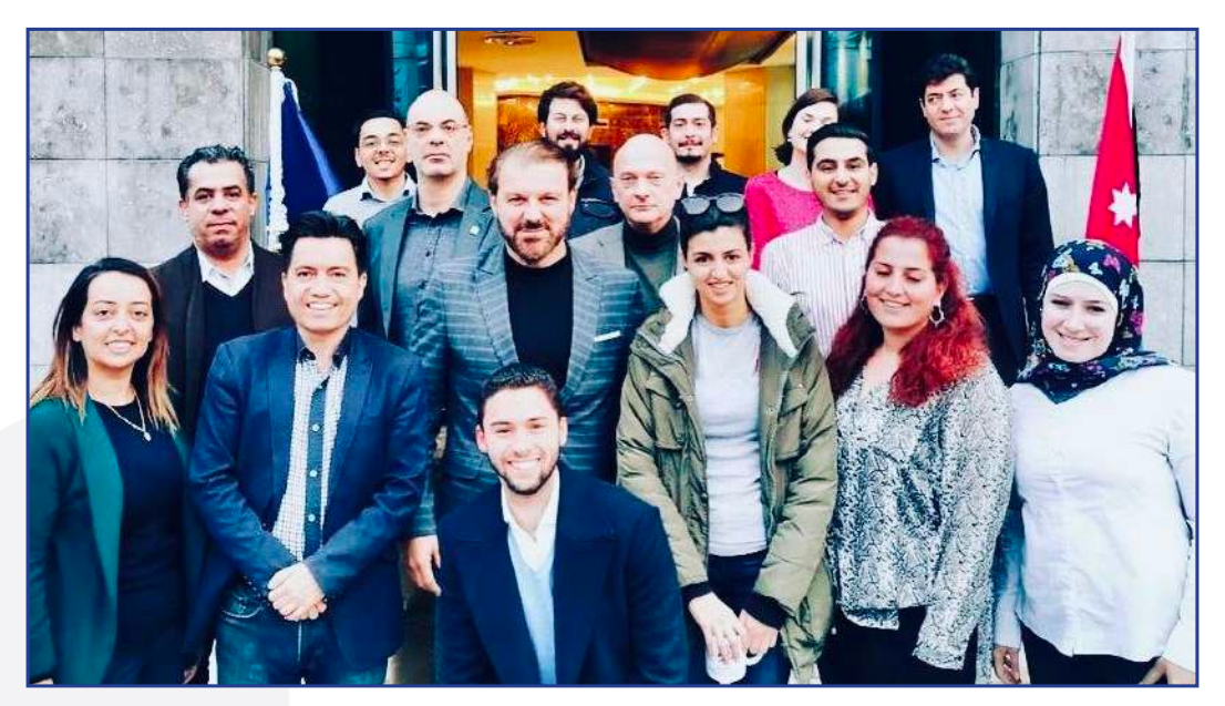
ECES Team in front of ECES office in Jordan (EU-JDID Project)

The methodology is based on concrete cases of peace mediation in electoral processes to draw lessons of common risks and windows of opportunities for conflict settlement around the electoral cycle. It thereby fills an important gap by offering concrete guidance when attempting to mediate — or support peace mediation efforts in electoral processes or crises that arise or escalate due to flawed elections.