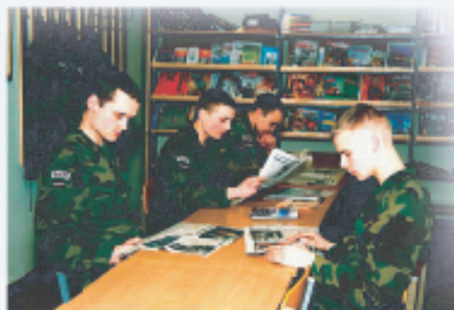
At the reading-room